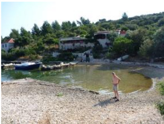
Best fish from the wood fire