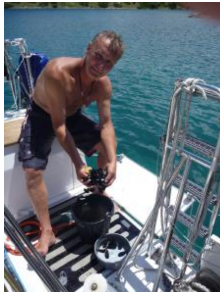
1 kg fresh mussels from the stones