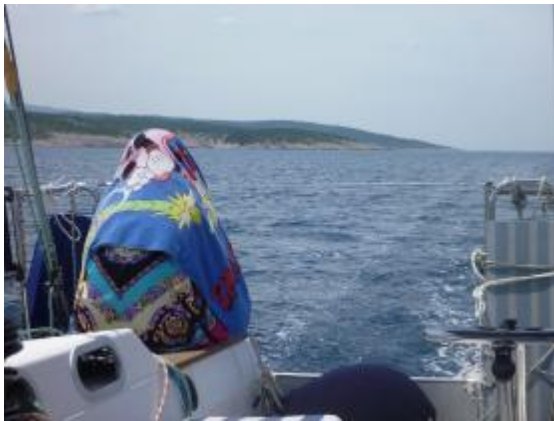
Fishing (Chines style)