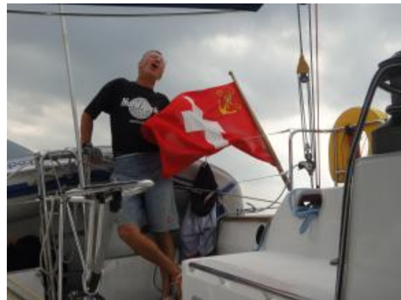
Very happy skipper after such a voyage

We were very surprised from Croatia, very clean, good organised, very busy people, good prices, good advertising of the treks for MTB and walking people. Many ruin's well refurnished, the houses fit perfect in the landscape. The Croat's are not friendly from the beginning, only after some time with the confidence they became colleges. The many island's given from the nature are spectacular. In summer time the winds are perfect for sailing, in the morning from the hills F2 to F5 (Borina) and in the afternoon the Mestrals NW F3 to F4. For the winter the boat should be out of the water due to the Bora with winds up to 100 kn.