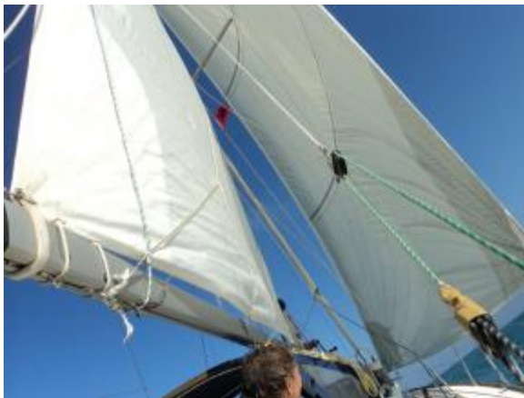
Code Zero 88m2, 80 % used in head wind