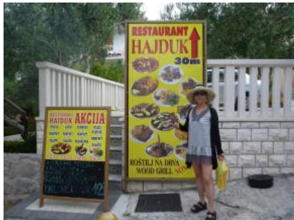
Good and cheap meal