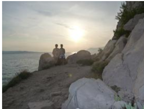
Sitting in the sunset