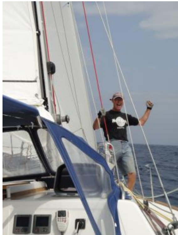
11 knots speed