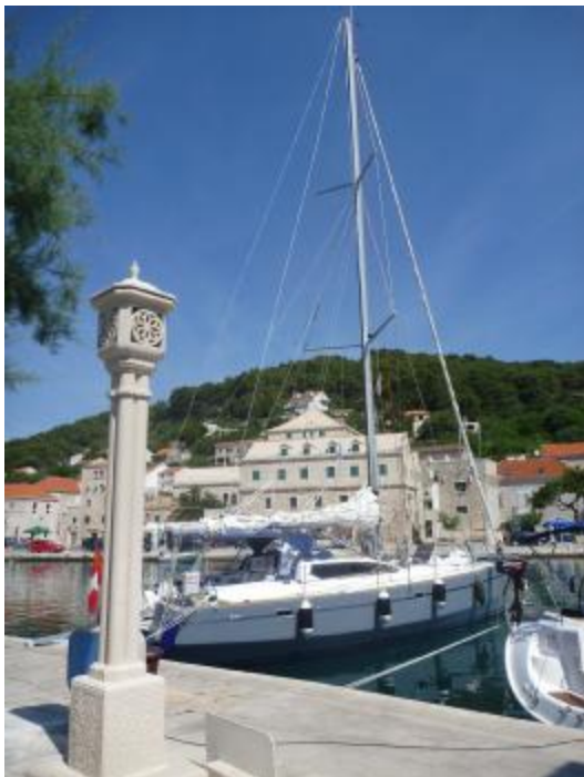
Pucisca wonderful place all in marmor