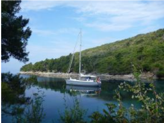
Prapatna lonely bay, island Hvar

In June 2011 we sailed every morning with the best wind direction. So we achieved to visit 10 wonderful islands in 10 days. 250 sm of nice sailing with winds from F 2 to F7. Once reaching we surfed up to 11kn with 2 reefs in the main and full genua. At least 210 sm we were under sail. The following pictures express the beauty of this special trip.