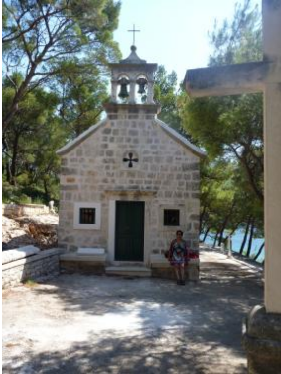
Little small chapel